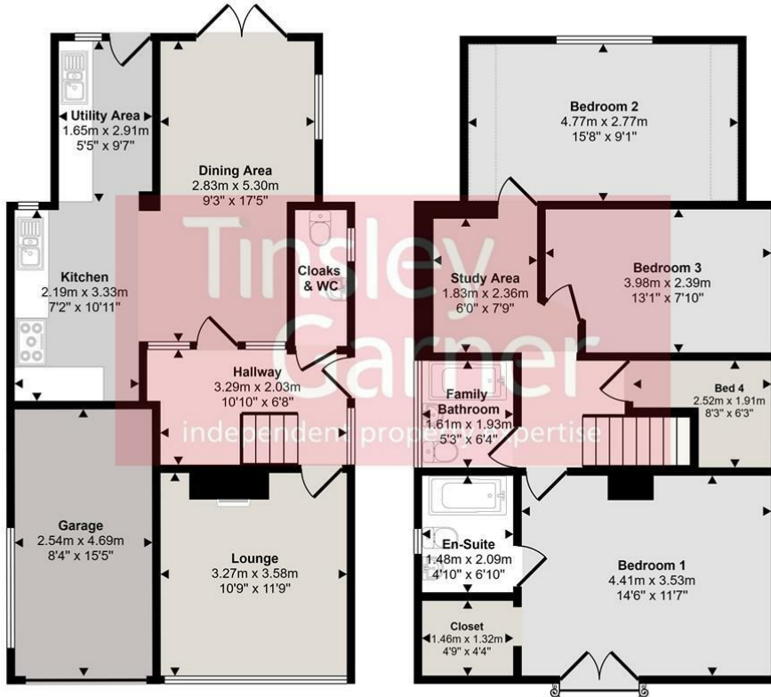
Ground Floor Approx 63 sq m / 676 sq ft

Approx Gross Internal Area 127 sq m / 1363 sq ft